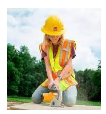
Tools - Hand and Power